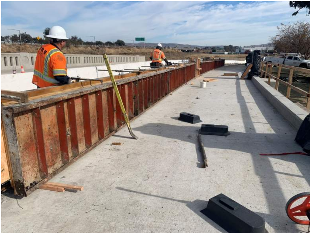
Figure 5 – TxDOT C4111 Interior Barrier Rail Forming – Spans 4 and 5