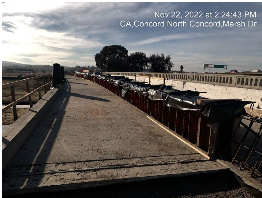
Figure 4 – TxDOT C411 Interior Barrier Rail Forming – Spans 4 and 5