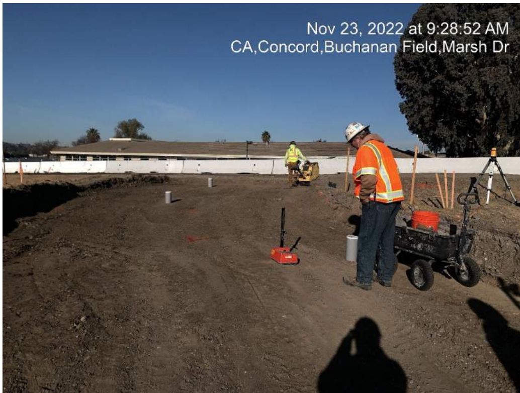
Figure 2 – Access Road 1 – Compaction Testing