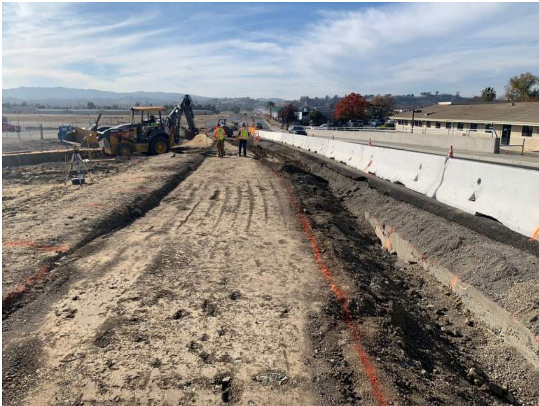
Figure 3 – West Approach Grading