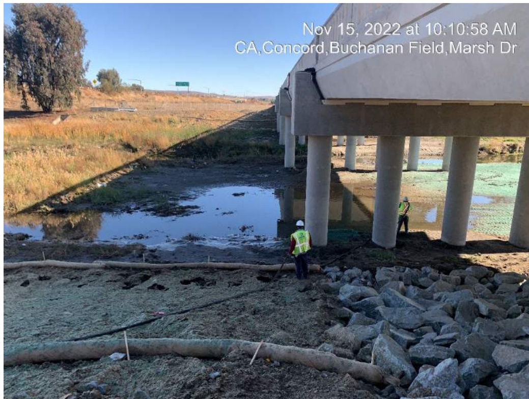
Figure 4 – Hydroseeding Flood Plain