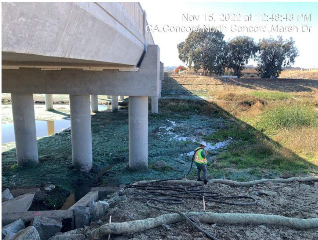
Figure 3 – Hydroseeding Flood Plain