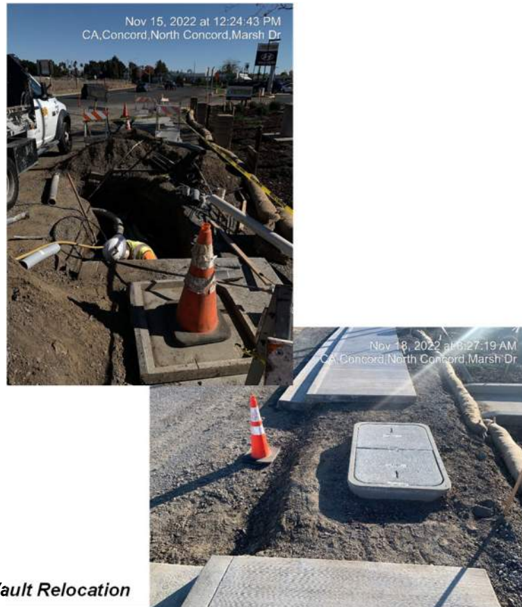
Figure 2 – Stage 2 AT&T Vault Relocation