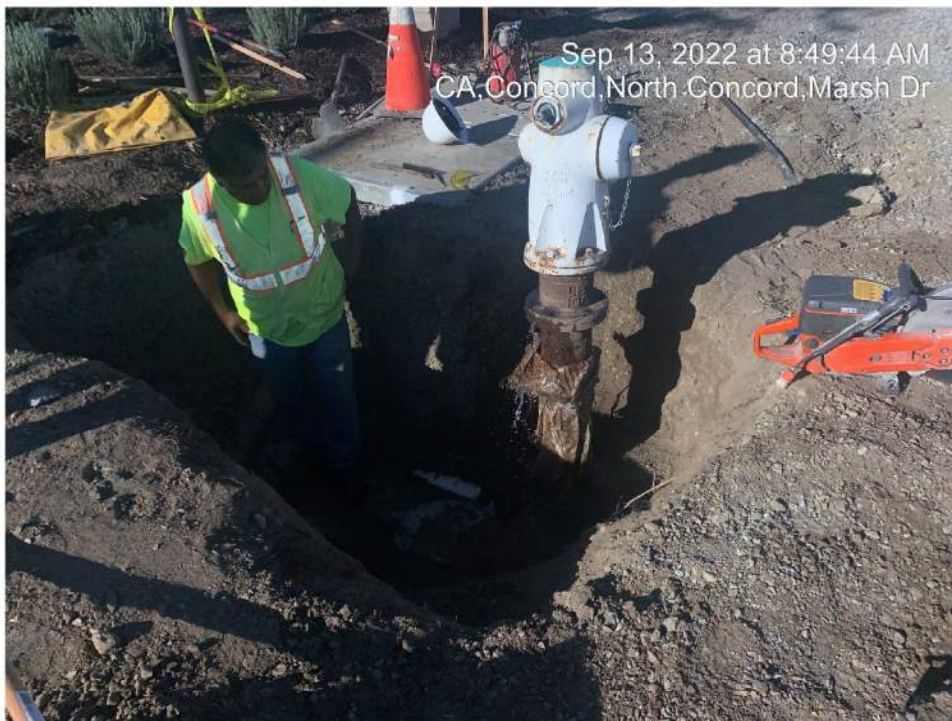
Figure 4 – Fire Hydrant Relocation