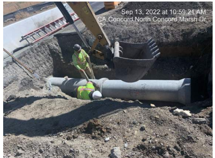
Figure 2 – Stage 2 Drainage System