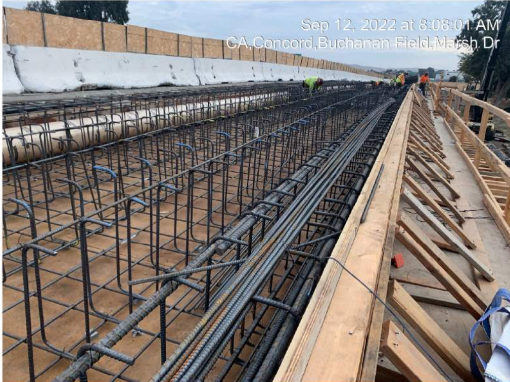
Figure 3 – Deck Rebar and Sono-Voids