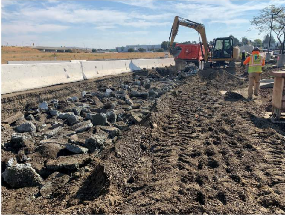
Figure 4 – Pulverize & Remove Existing CTPB