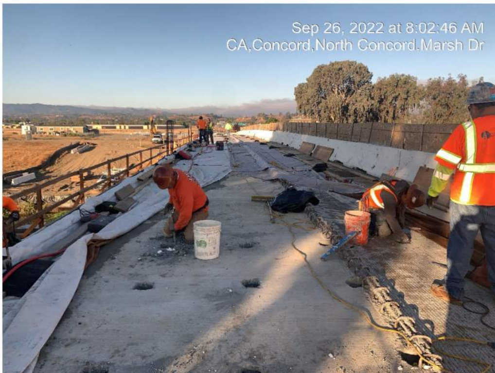
Figure 4 – Marsh Drive Decking and Sono-Voids