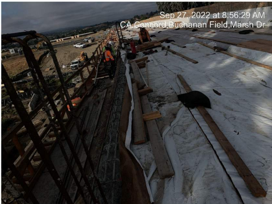
Figure 3 – Cure Blankets + Strip OH at Shear Keys