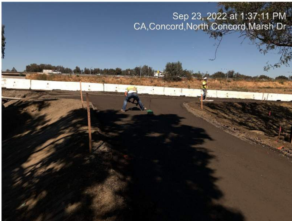
Figure 5 – Stage 2 Roadwork – Iron Horse Trail