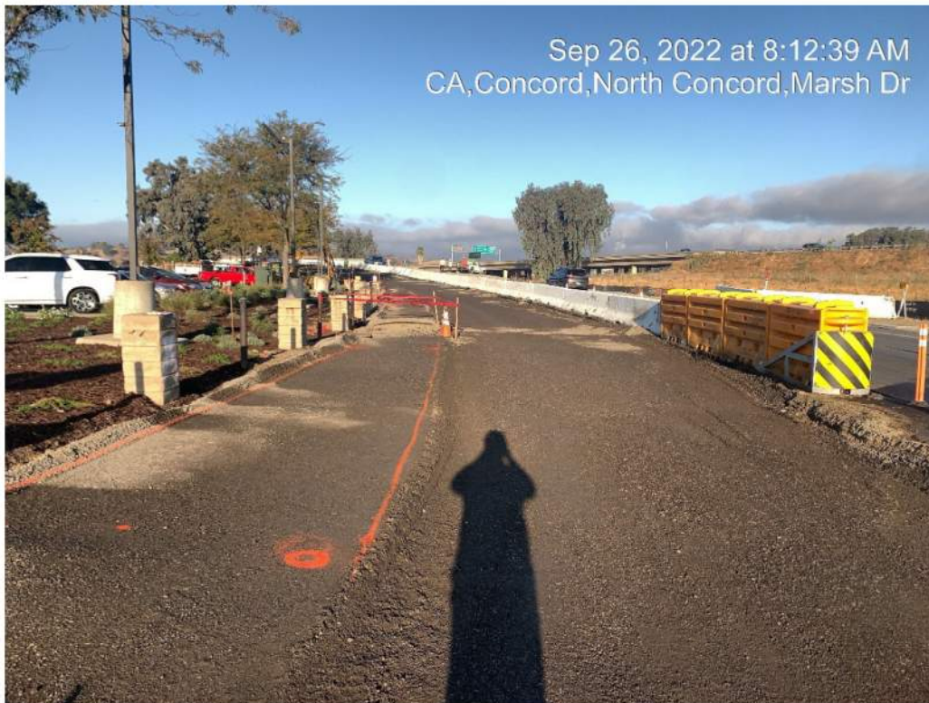
Figure 2 – Marsh Drive – East Approach