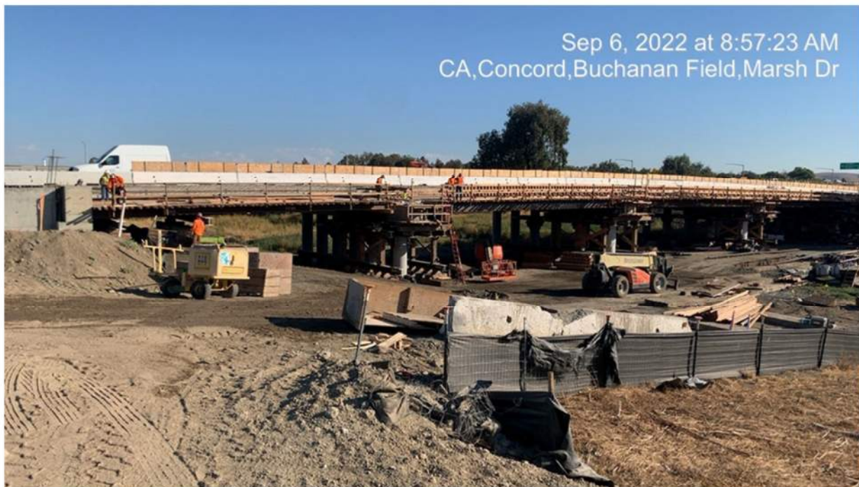
Figure 2 – Bridge Deck Construction