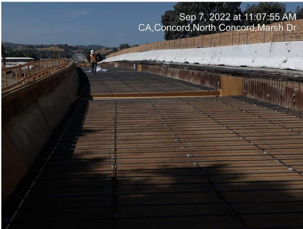
Figure 4 – Deck Rebar BTM Mat