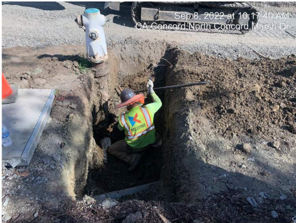
Figure 7 – Fire Hydrant Relocation