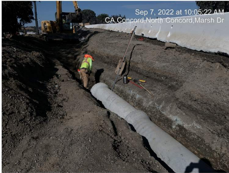
Figure 6 – Completing Drainage System 2