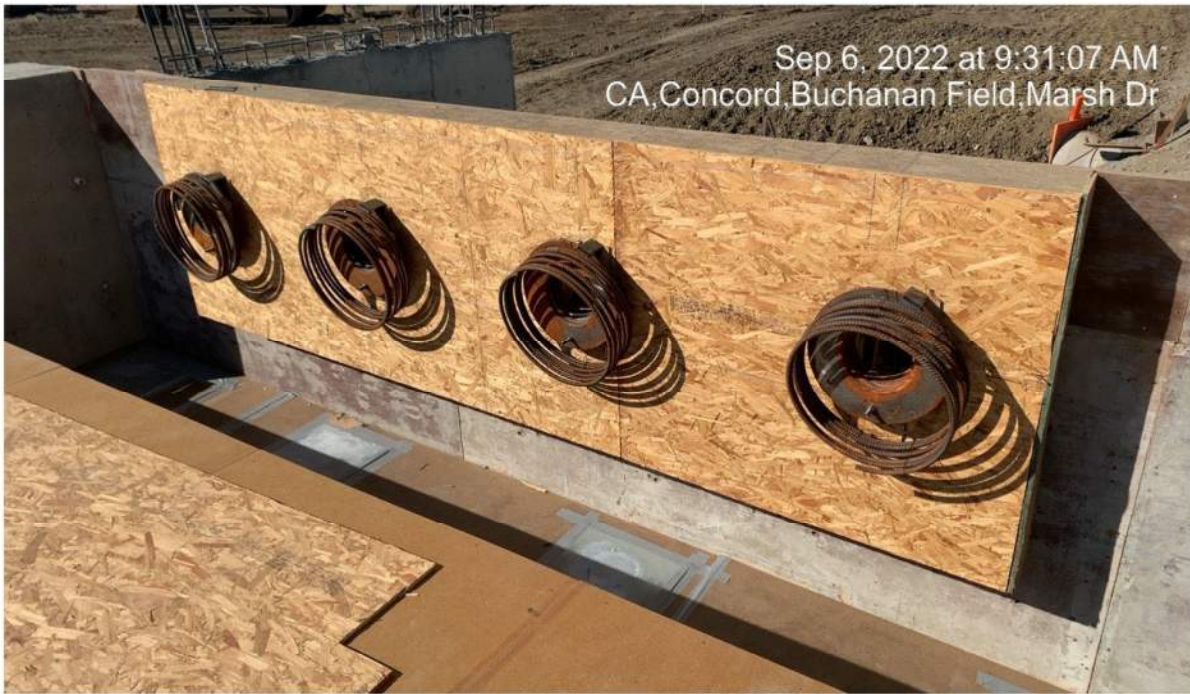
Figure 3 – Abutment Post Tensioning Hardware