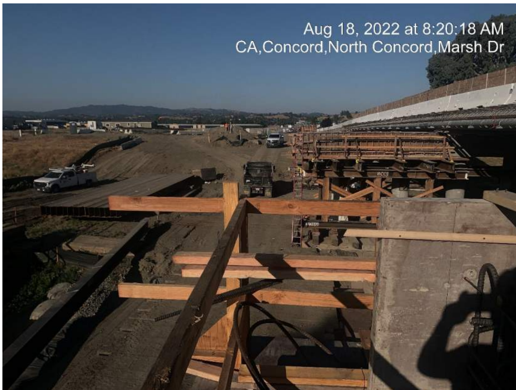
Figure 2 – Pier Caps