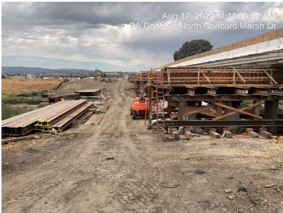
Figure 6 – Pier Cap Falsework and Forms