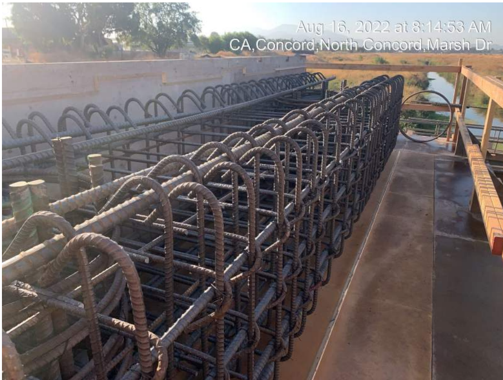
Figure 5 – Pier Cap Forming and Rebar