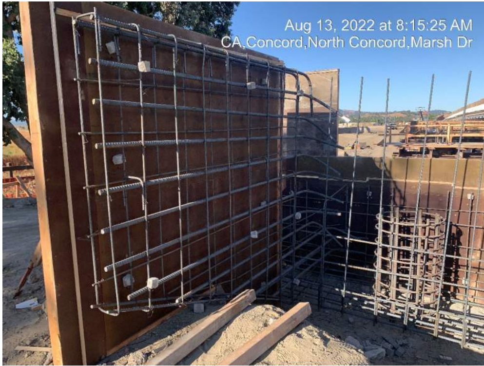
Figure 3 – Abutment 6 Forming and Rebar