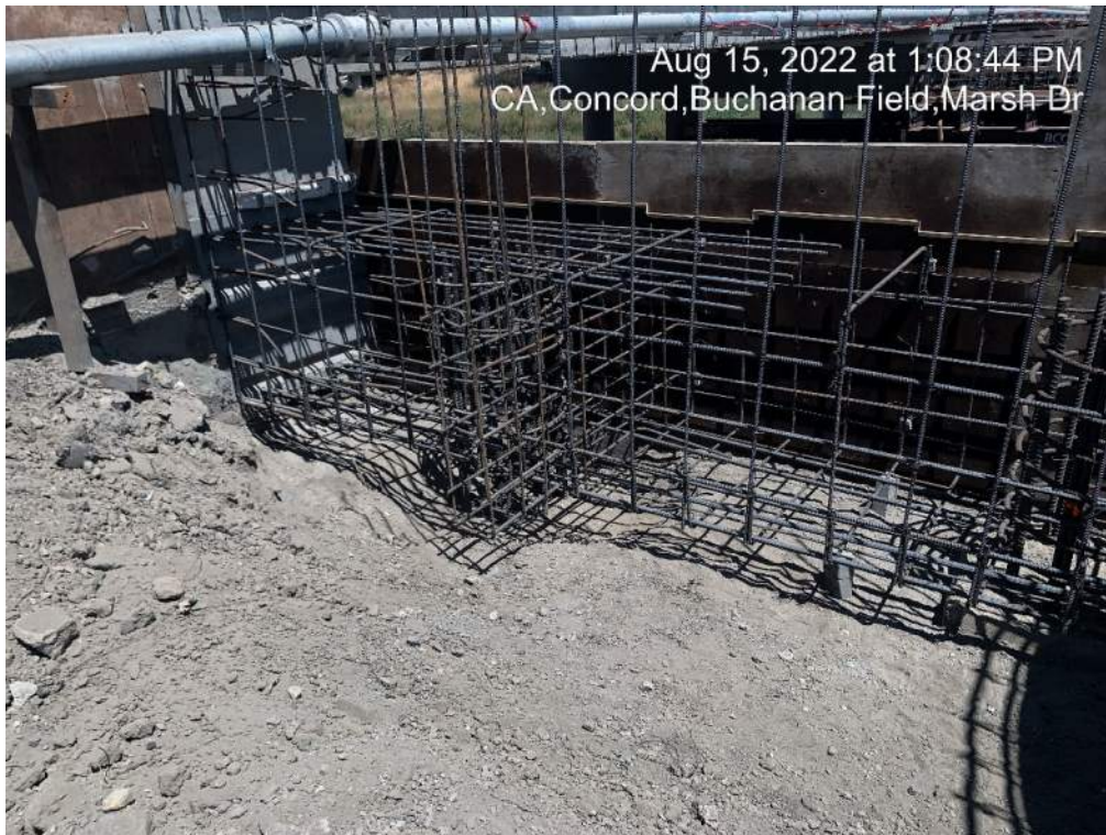
Figure 4 – Abutment 1 Forming and Rebar