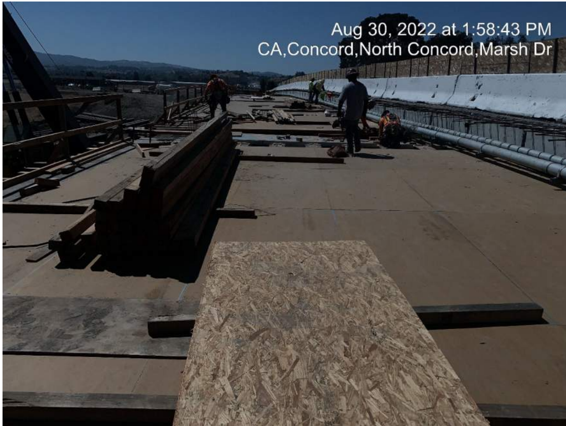
Figure 2 – Deck Soffit & Edge of Deck Forming