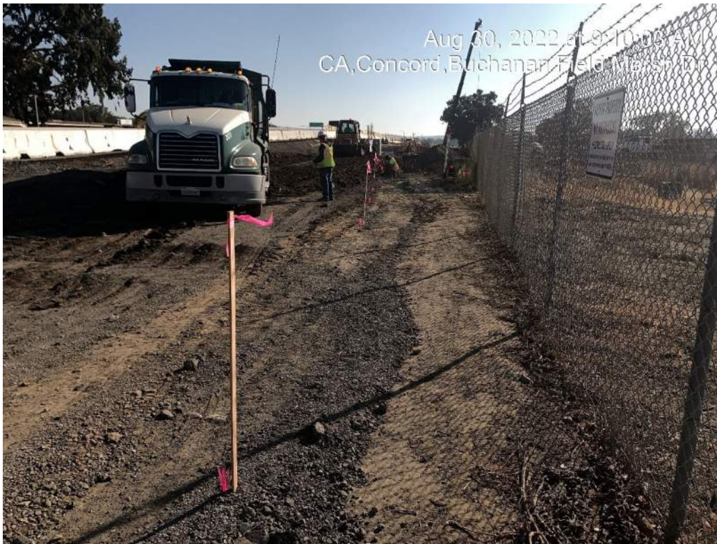
Figure 4 – Stage 2 - Roadwork