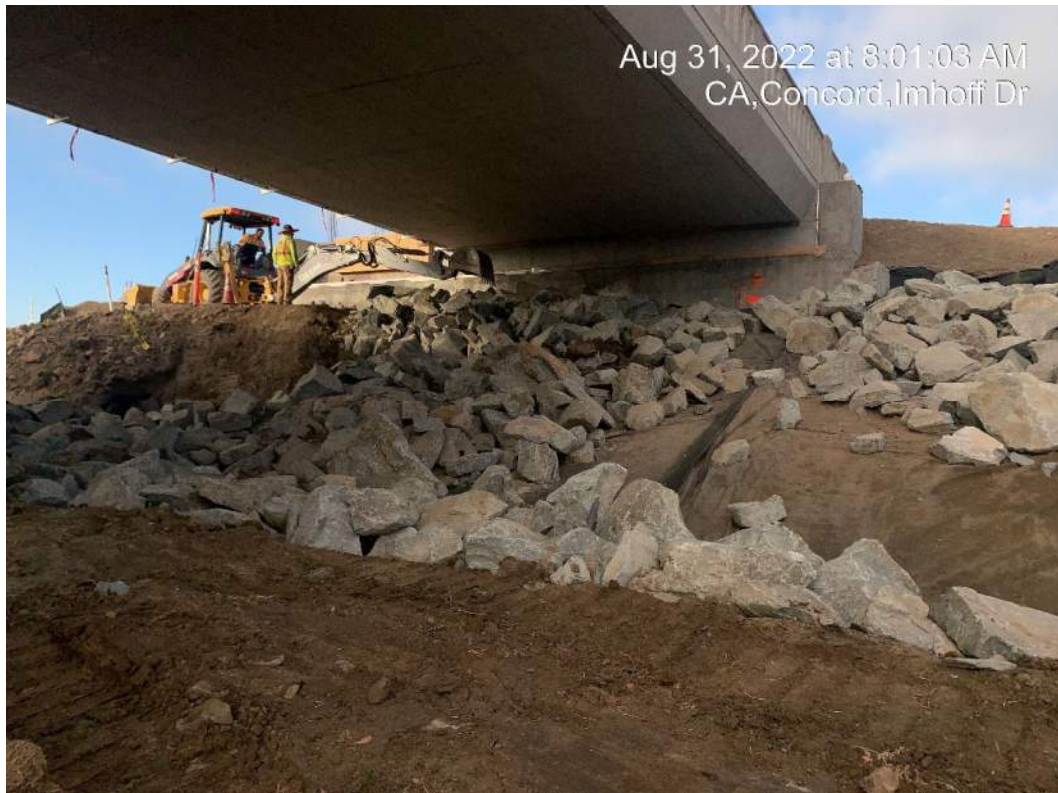
Figure 3 – Abutment 1 Rock Slope Protection