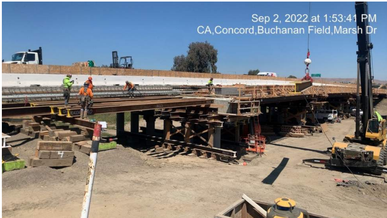
Figure 5 – Bridgework – Falsework and EOD Forming