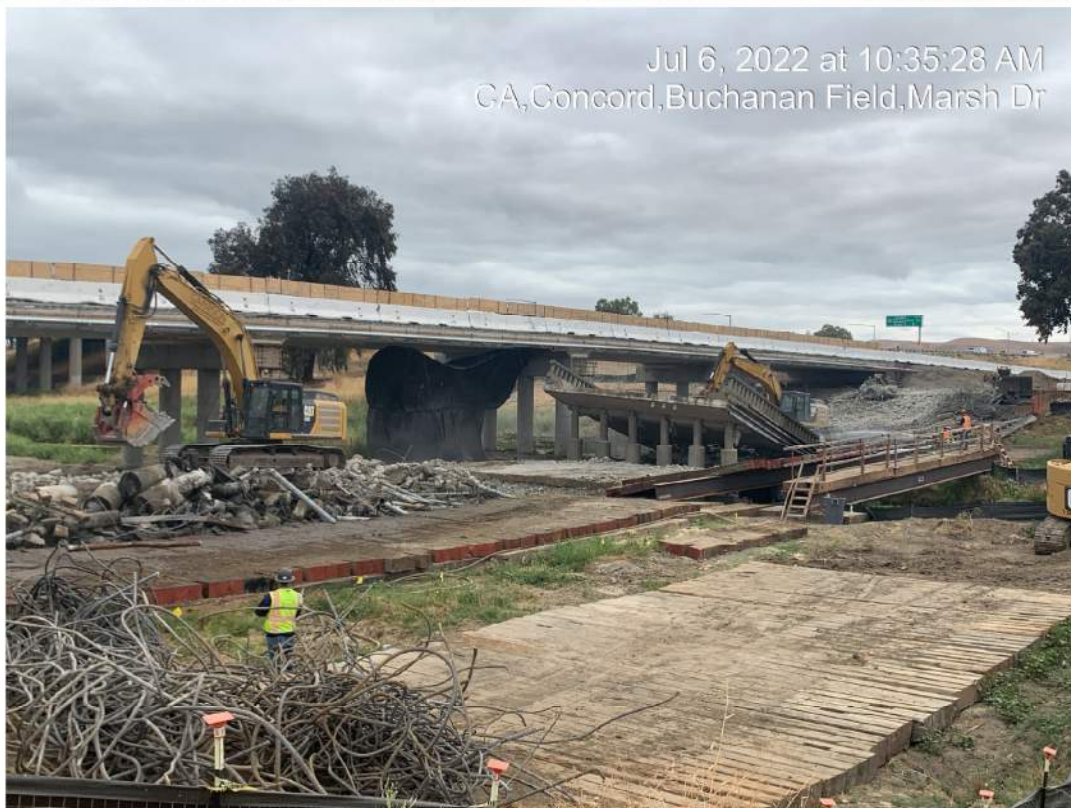
Figure 4 – Bridge Removal