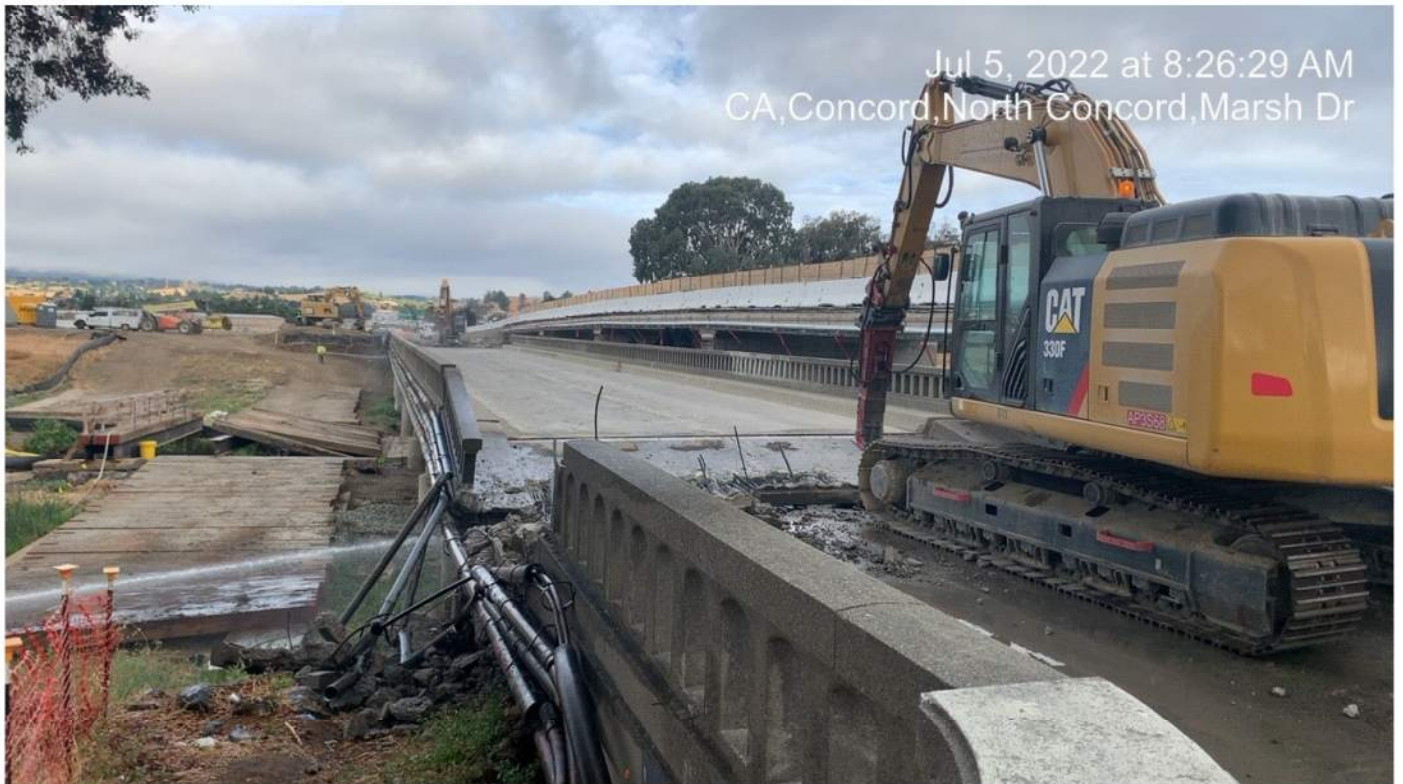
Figure 2 – Bridge Removal