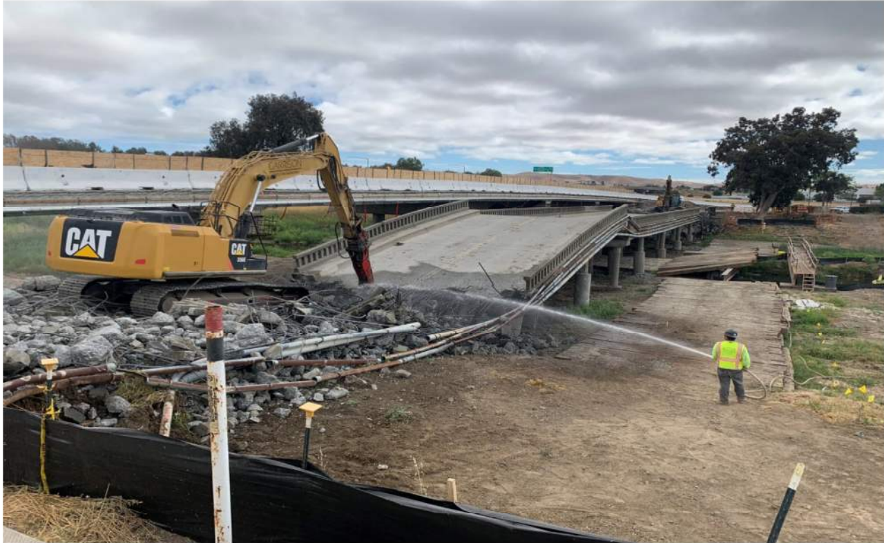
Figure 3 – Bridge Removal