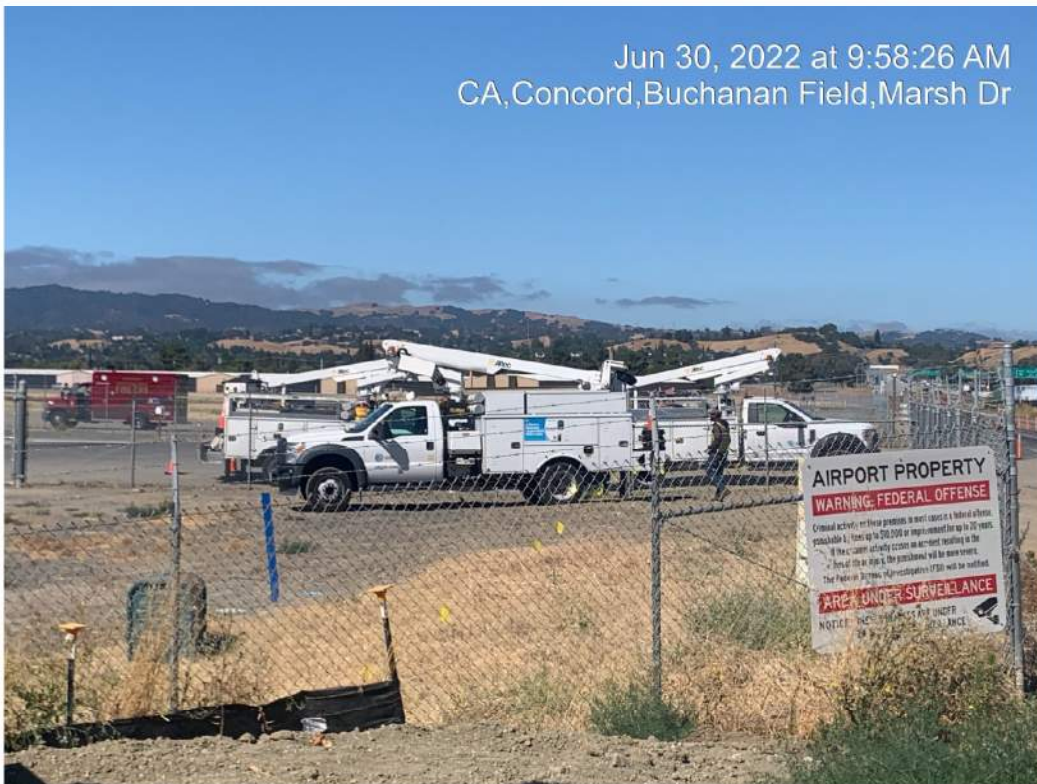
Figure 3 – AT&T Cutover