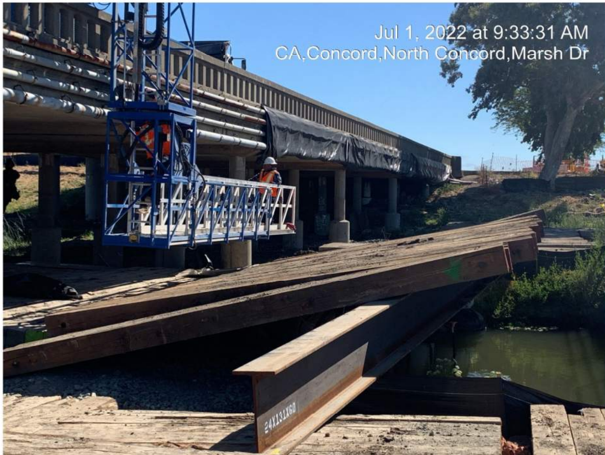
Figure 4 – Removing Bird Exclusion System