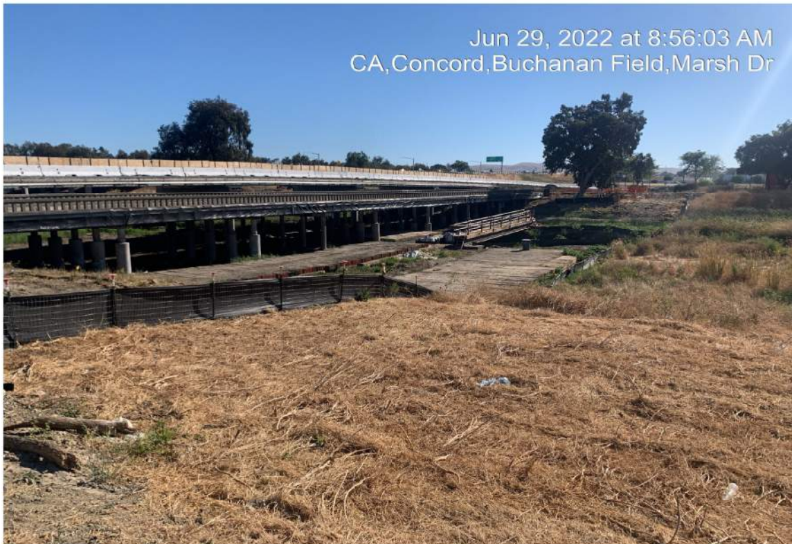
Figure 2 – Creek Protection System