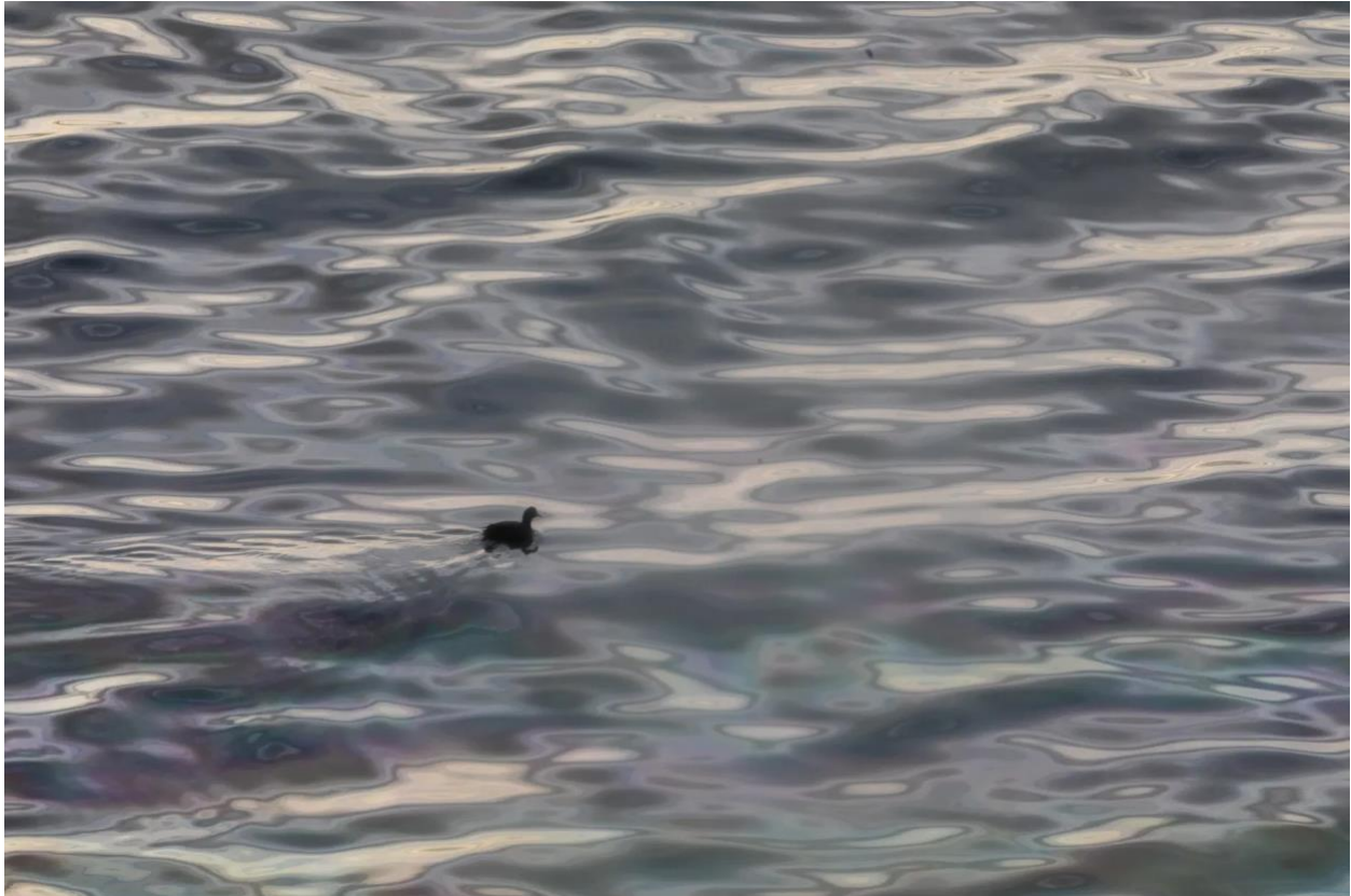
RICHMOND, CA – February 9: A duck swims through oil slick as a five gallon per minute petroleum leak washes in near the Chevron Long Wharf in Richmond, Calif., on Tuesday, Feb. 9, 2021.

from Chevron Richmond that was updated Wednesday. Personnel shut down the pipeline, according to a statement.